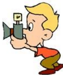
PHOTO Directory – 60th Anniversary Edition! // April 27,28 and May 4,5 // Founders' Room // Please pick up an information package at the Welcome table or in the gym after service. We will be booking the sittings right after Easter. Please set aside time to be sure you are included in this special directory. And remember – the sitting is free, the directory is free and your 8x10 portrait is free.